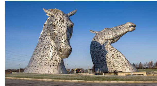
THE HELIX: HOME OF THE KELPIES