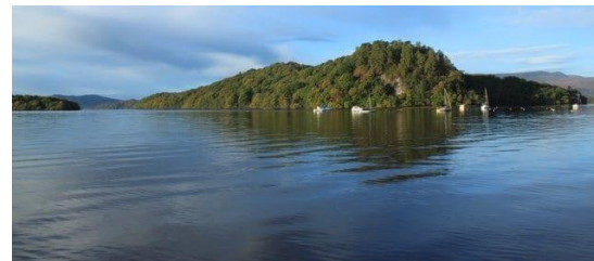
Visit the Island of Inchcailloch whilst in Balmaha.

Film location for Ivanhoe , Monty Python and the Holy Grail .